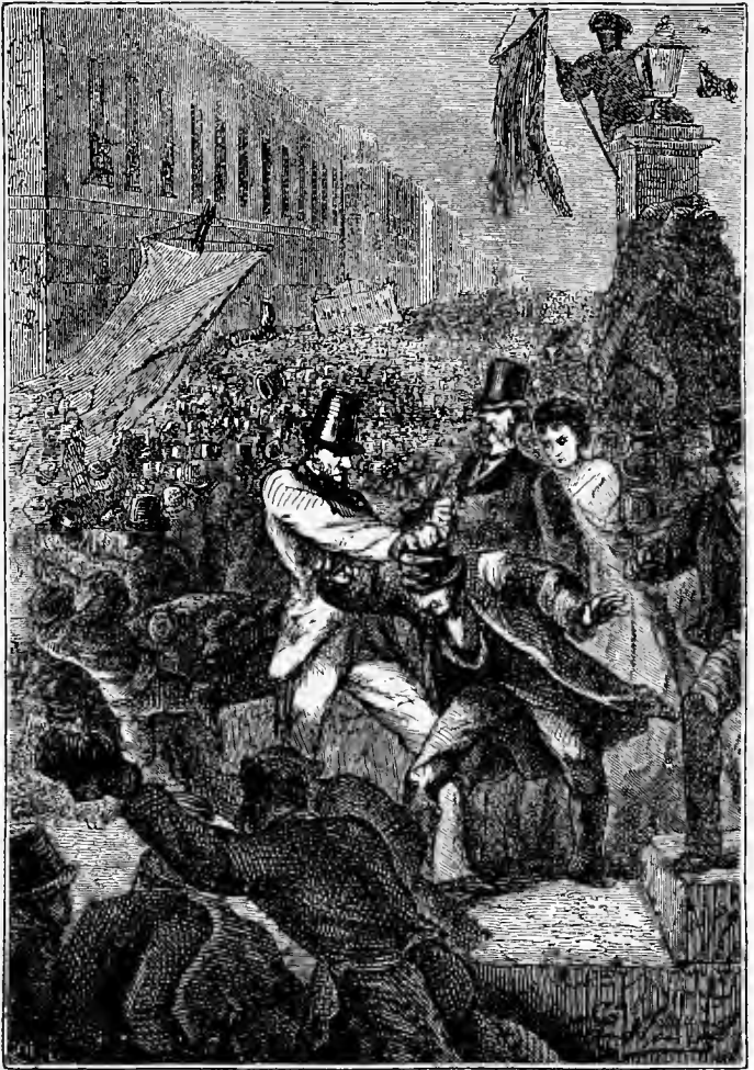
If Fix had not, devotedly, received the blow . . .